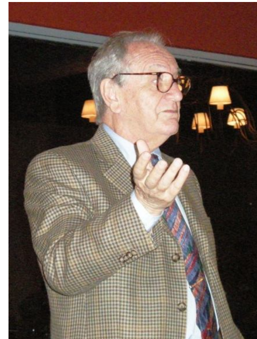
2010, Buenos Aires, Argentina 37 th ICBDSR Annual Meeting