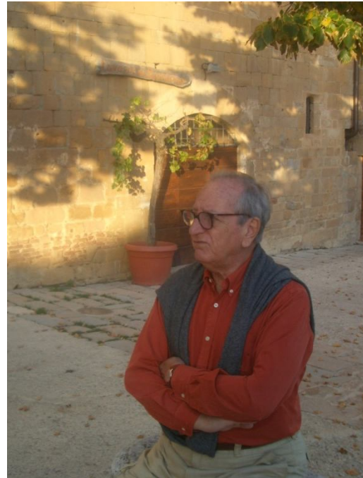
2007, Chianciano, Italy 34 th ICBDSR Annual Meeting